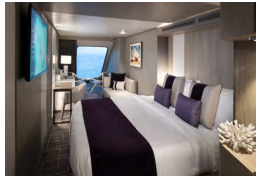
Ocean View Stateroom from $1168.96 pp*