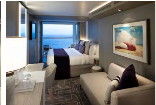
Infinite Veranda Stateroom from $1486.96 pp*

*Prices are per person, based on double occupancy in USD.