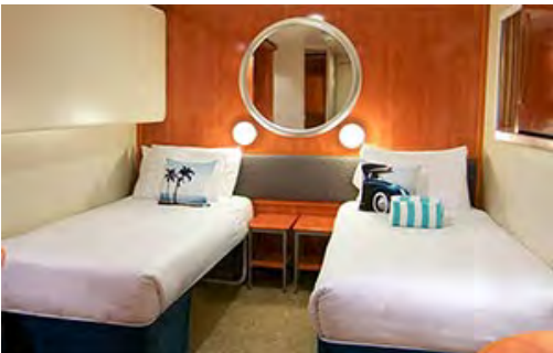
Inside Stateroom from $2928.83 pp*