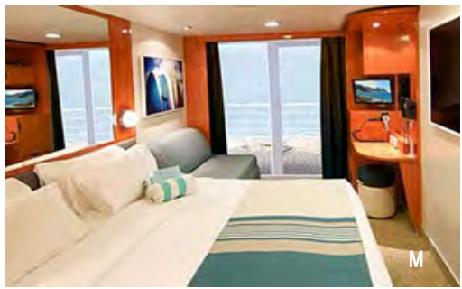
Balcony Stateroom from $3795.02 pp*

*Prices are per person, based on double occupancy.