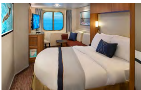
Ocean View Stateroom from $3288.25 pp*