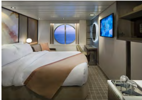
Ocean View Stateroom from $2899.87 pp*