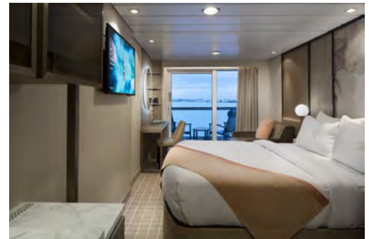
Veranda Stateroom from $3449.87 pp*

*Prices are per person, based on double occupancy in USD.