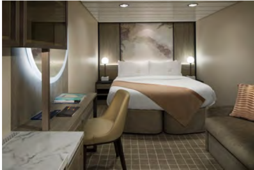
Inside Stateroom from $2639.87 pp*