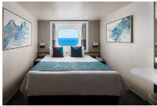
Ocean View Stateroom from $3541.39 pp*