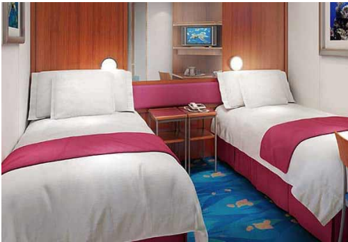
Inside Stateroom from $3303.54 pp*