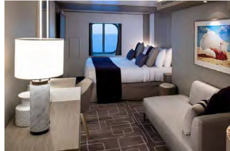
▶ 360° Virtual Tour