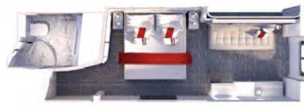
Ocean View Stateroom from $3535.21 pp* *Double occupancy