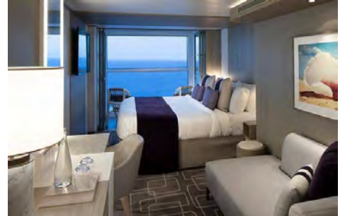
▶ 360° Virtual Tour