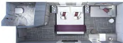
Inside Stateroom from $3387.21 pp*