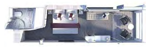
Infinite Veranda Stateroom from $3876.21 pp*