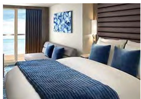
Balcony Stateroom from $2148.32 pp*

*Prices are per person, based on double occupancy.