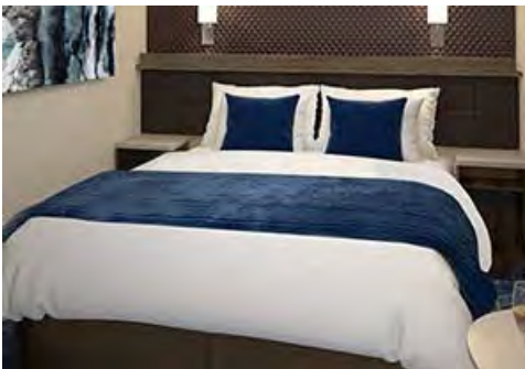
Inside Stateroom from $1882.16 pp*